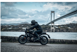
Svartpilen 401 2024 (3)