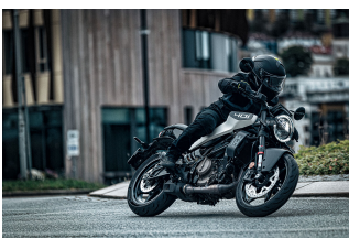
Vitpilen 401 2024 (4)