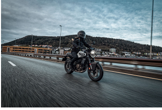
Vitpilen 401 2024 (6)