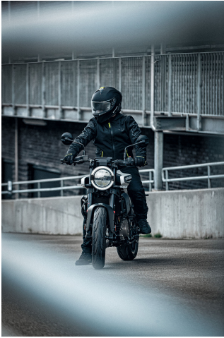
Vitpilen 125 2024 (4)