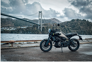
Svartpilen 401 2024 (5)