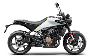
Vitpilen 125 2024 (7)