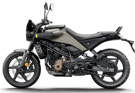
Svartpilen 250 2024 (5)