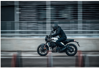
Vitpilen 125 2024 (5)