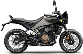
Svartpilen 401 2024 (8)