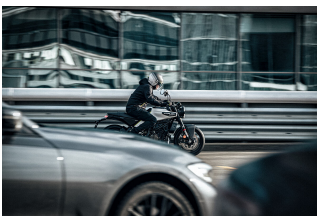
Vitpilen 125 2024 (2)