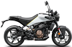
Vitpilen 401 2024 (9)