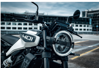
Vitpilen 401 2024 (2)