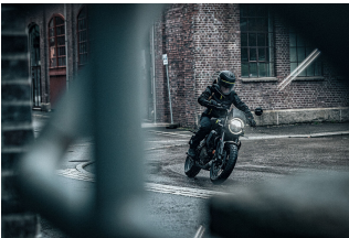
Svartpilen 125 2024 (5)