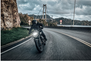
Svartpilen 401 2024 (6)