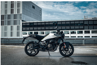
Vitpilen 401 2024