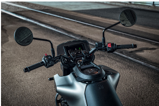
Svartpilen 401 2024 (2)