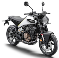
Vitpilen 401 2024 (11)