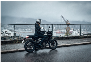
Svartpilen 125 2024 (7)