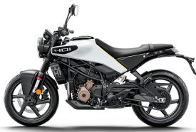
Vitpilen 401 2024 (8)