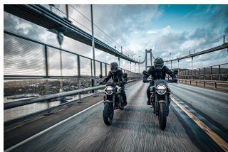
Vitpilen 401 and Svartpilen 401 2024