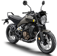
Svartpilen 401 2024 (10)