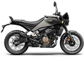
Svartpilen 125 2024 (8)