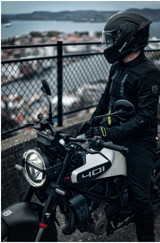
Vitpilen 401 2024 (7)