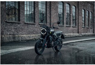
Svartpilen 125 2024 (4)