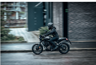
Svartpilen 125 2024 (6)