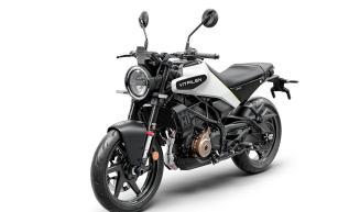
Vitpilen 125 2024 (8)