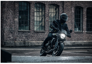
Svartpilen 250 2024