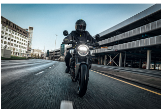
Vitpilen 125 2024