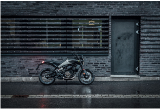
Svartpilen 125 2024 (3)