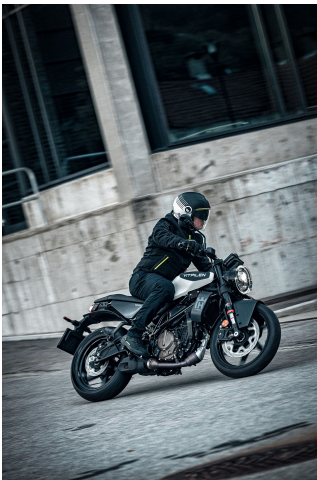
Vitpilen 125 2024 (6)