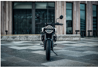
Vitpilen 125 2024 (3)