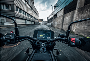
Svartpilen 125 2024 (2)