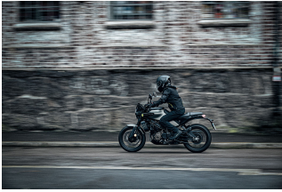
Svartpilen 125 2024