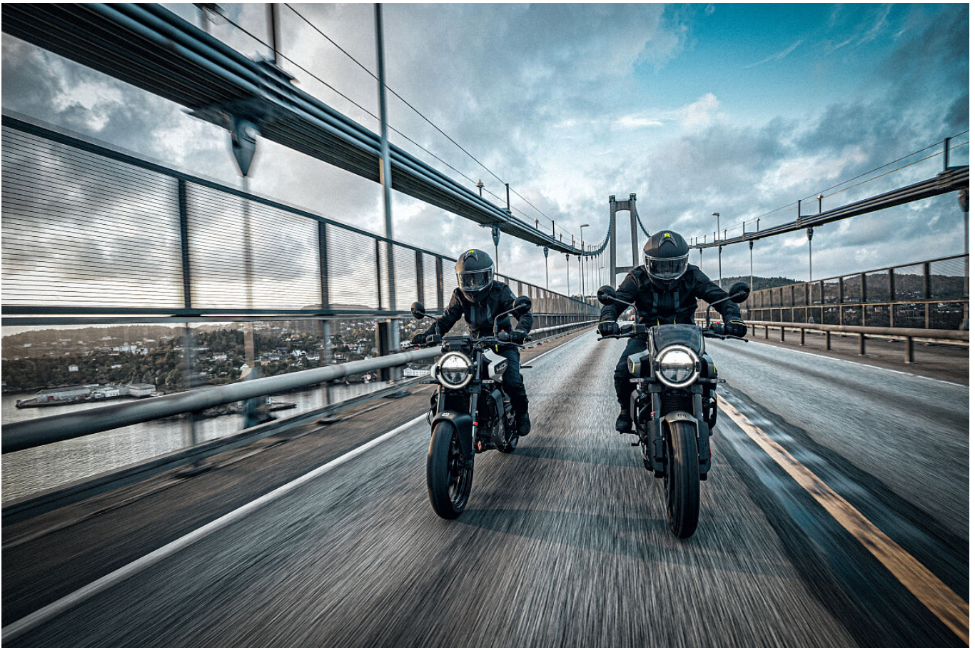
Vitpilen 401 and Svartpilen 401 2024

LATEST GENERATION STREET MOTORCYCLES SET TO DOMINATE THE ROADS IN 2024