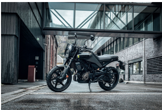
Svartpilen 250 2024 (2)