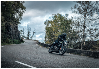
Svartpilen 401 2024 (4)