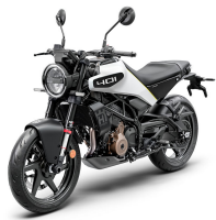
Vitpilen 401 2024 (10)