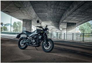
Svartpilen 401 2024