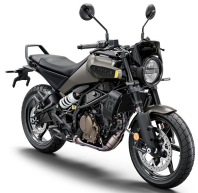
Svartpilen 250 2024 (6)