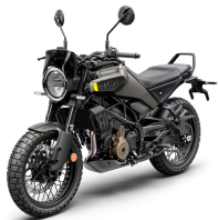
Svartpilen 401 2024 (9)