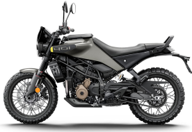
Svartpilen 401 2024 (7)