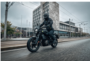
Svartpilen 250 2024 (3)