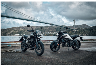
Svartpilen 401 and Vitpilen 401 2024