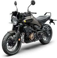
Svartpilen 125 2024 (9)