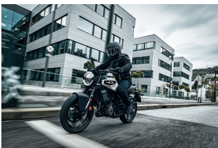
Vitpilen 401 2024 (3)