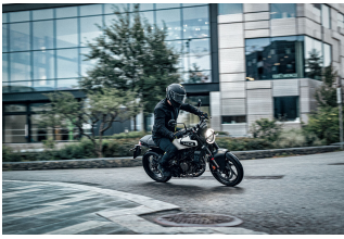
Vitpilen 401 2024 (5)